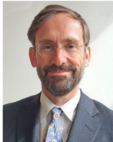
The Hon. Mr Justice Meade