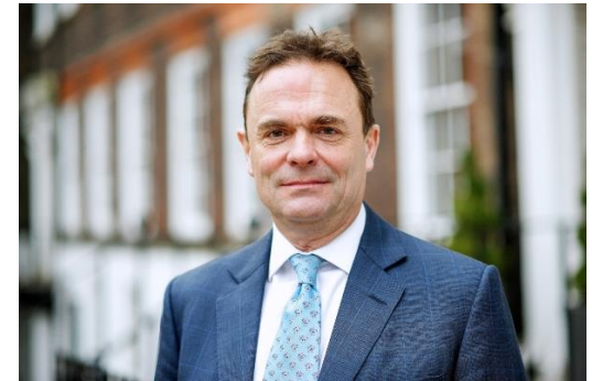
The Hon. Mr Justice Mellor